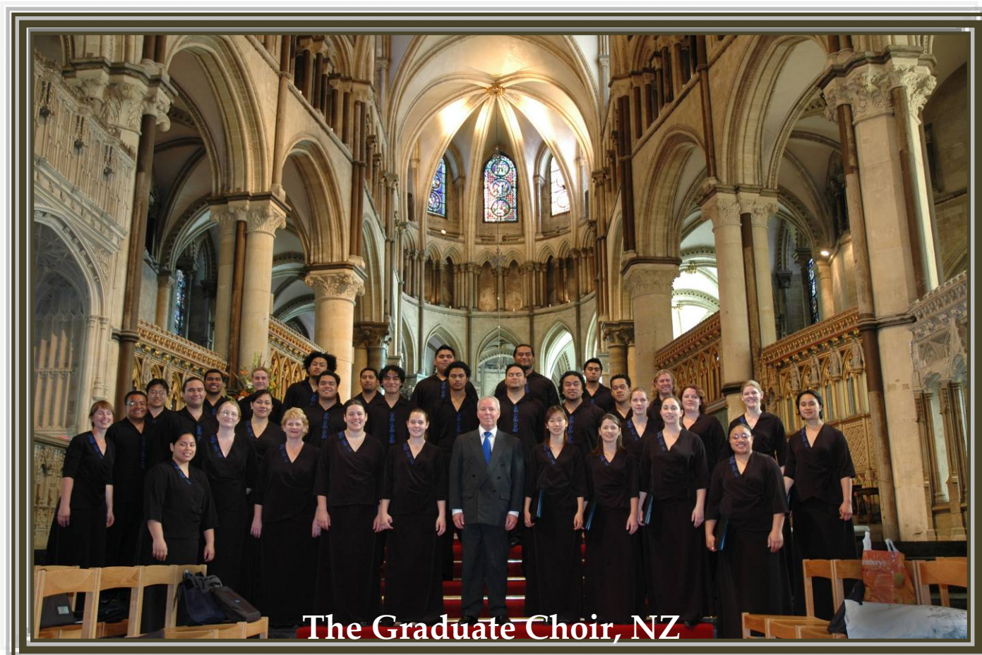
just after its lunchtime recital in Canterbury Cathedral, UK in 2005